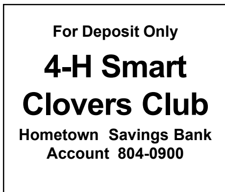
Figure 6. “For Deposit Only” rubber stamp.

not feel compelled to accept noncash gifts. The Extension agent responsible for 4-H Youth programs should be contacted whenever the group has questions about the appropriate action with respect to accepting and managing any donation.