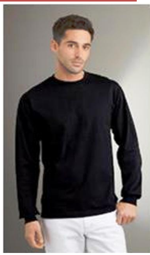
#3 T-Shirt LS (M)