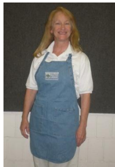
#15 Apron - 30"