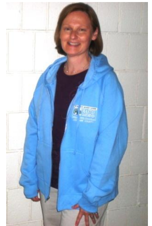
#9 Hoodie (W)