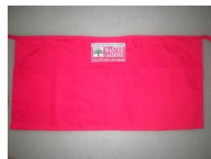
#16 Apron - Waist ("Macomb County" not available)