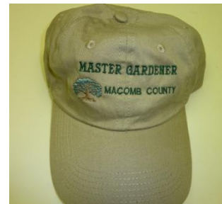
#13 Baseball Cap

(#12 & #13: Choose Master Gardener logo or "Master Gardener Macomb County")