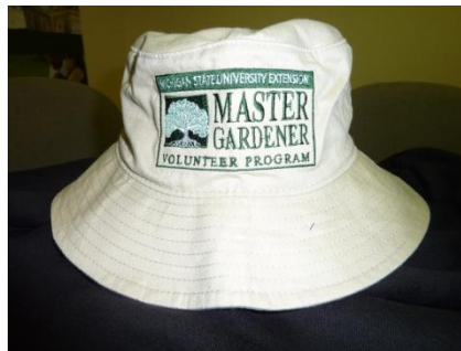
#12 Bucket Hat

(#12 & #13: Choose Master Gardener logo or "Master Gardener Macomb County")