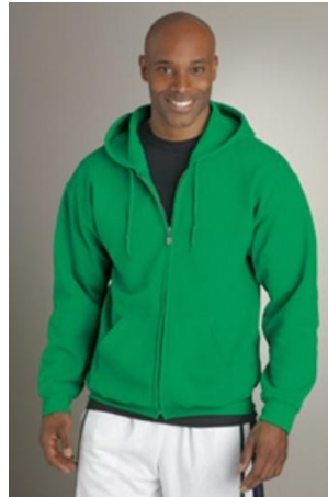
#8 Hoodie (M)