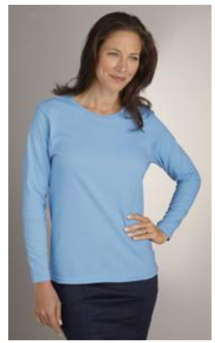
#4 T-Shirt LS (W)