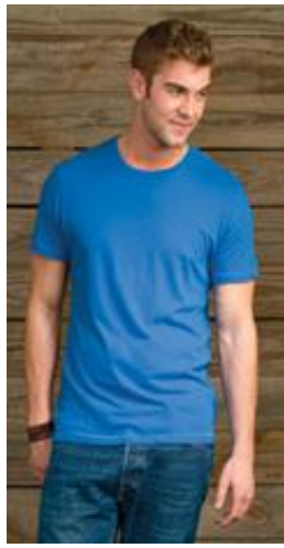
#1 T-Shirt (M)