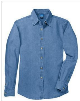
#10 / #11 Denim Shirt (M/W)