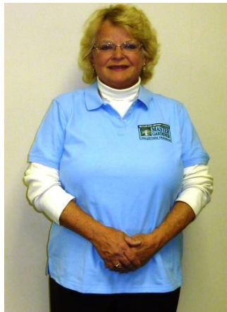
#5 / #6 Polo (M/W)