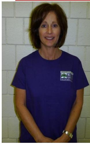
#2 T-Shirt (W)