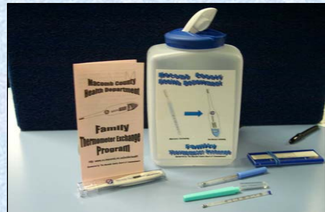
Mercury Thermometer Exchange