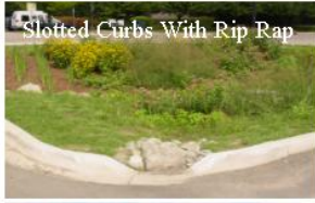
Slotted Curbs With Rip Rap