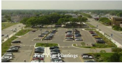
First Year Plantings