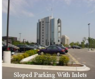
Sloped Parking With Inlets